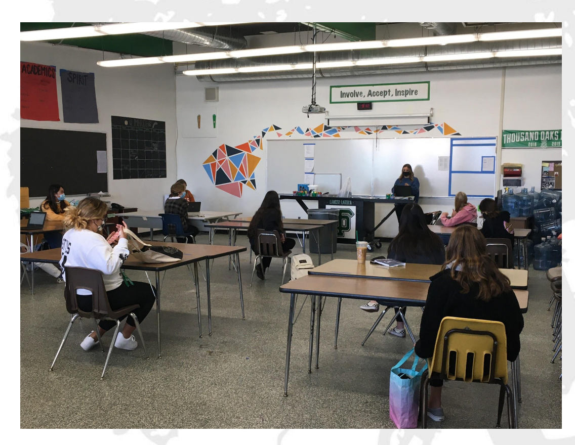
TOHS - ASB